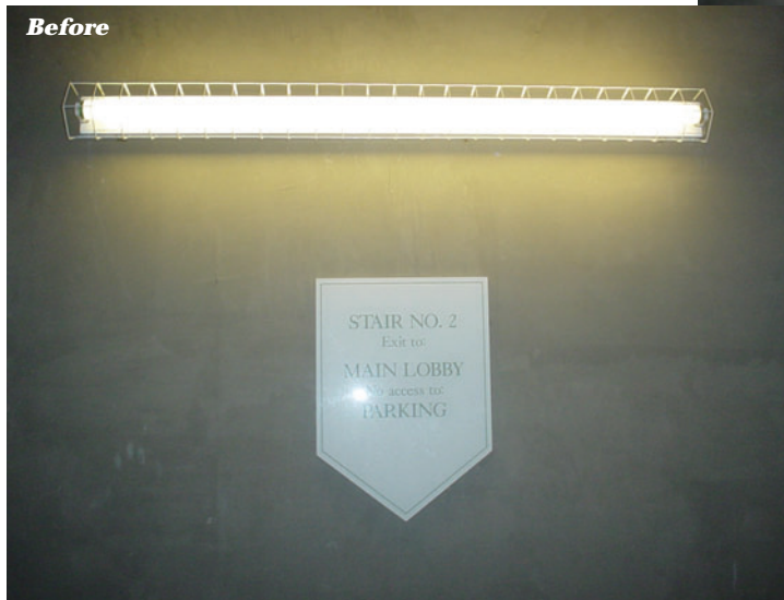
Before is the original T12 fixture in a stairwell of a large national chain hotel, and the after photo is a bi-level fixture installed in the same location.

Until recently, stairwell lighting wasn't looked at as an energy conservation measure by energy services companies and facilities managers alike. Stairwells never really represented a significant